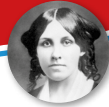
Louisa May Alcott